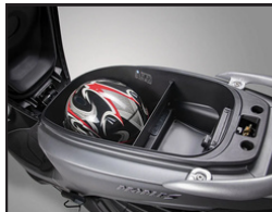
LARGE UNDERSEAT STORAGE