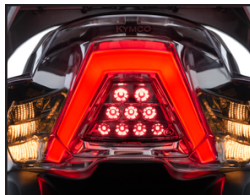
FULL LED LIGHTING