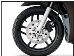
ANTI-LOCK BRAKING SYSTEM