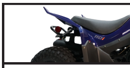
REAR GRAB BAR