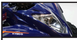
LOW & HIGH BEAM HEADLIGHT