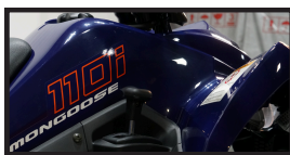
FULLY AUTOMATIC CVT TRANSMISSION