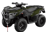
FLAT DEEP GREEN