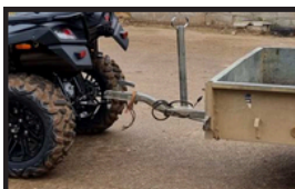
965 LBS. TOWING CAPACITY