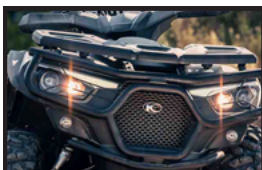
DUAL LOW-AND-HIGH BEAM HEADLIGHTS